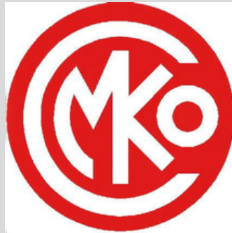
Morrison Knudsen Foundation مجموعة موريسون كوندسون